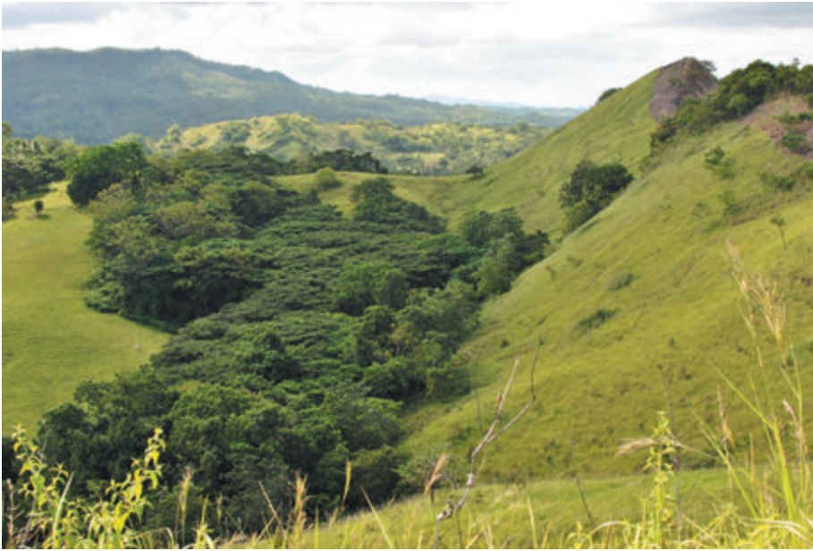
Figure 21. Forest along a gully surrounded by grassland