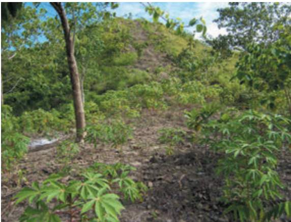
Figure 17. Firebreak planted with crops

One strategy that can help to ensure sustained maintenance, and at the same time reduce costs, is to encourage local residents to plant food crops in the firebreaks. In this way, local communities have strong motivation for preventing fire from entering an ANR area. The food they harvest can supplement their diets or be sold for income. Depending on soil conditions, rainfall and community preference, many different crops can be grown successfully in firebreaks. Some of the more popular ones include taro ( Colocasia esculenta ), pigeon pea ( Cajanus cajan ), pineapple ( Ananas comosus ), sweet potato ( Ipomoea batatas ), cassava ( Manihot esculenta ), ginger ( Zingiber officinale ) and bananas ( Musa sp. ). Food crops to be planted should be succulent and green as not to become fire hazards.