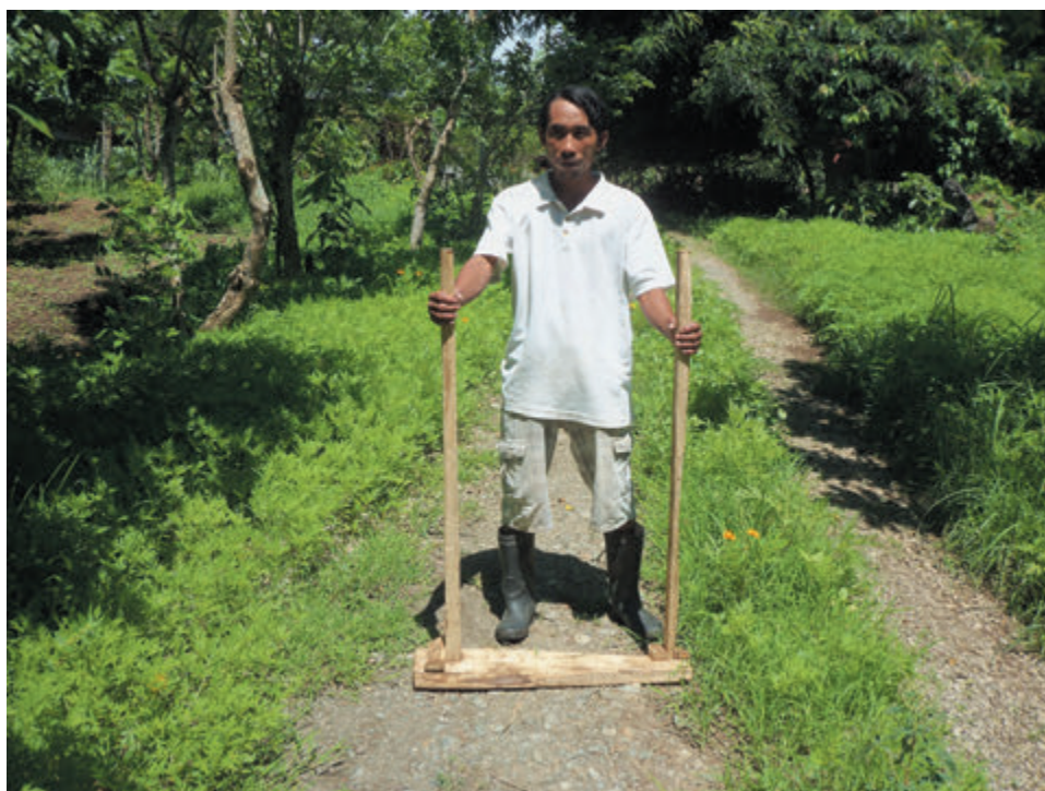
Figure 12. Lodging board used for steep slopes

Another variation in pressing is recommended when working on steep slopes. Instead of controlling the board with a rope passing over the shoulders, it is advisable to use a shorter board with handles attached on the ends. The main reason for using a short