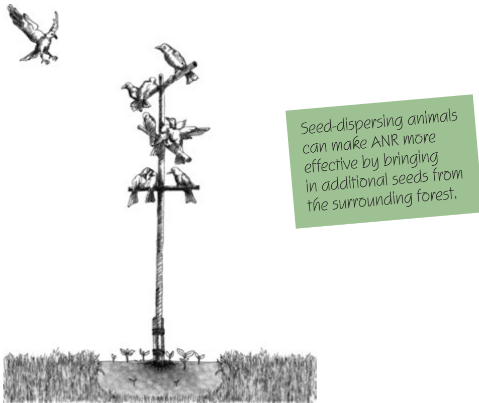
Figure 19. Bird perches can help attract seed dispersing birds to the restoration site

Seed dispersal is a vital and free ecological service which ensures recolonization of ANR sites by a wide range of forest tree species. Artificial bird perches are a rapid and cheap way of attracting birds and increasing the seed rain in restoration sites. Perches are usually 2-to-3-m-high posts, with cross-bars pointing in different directions.