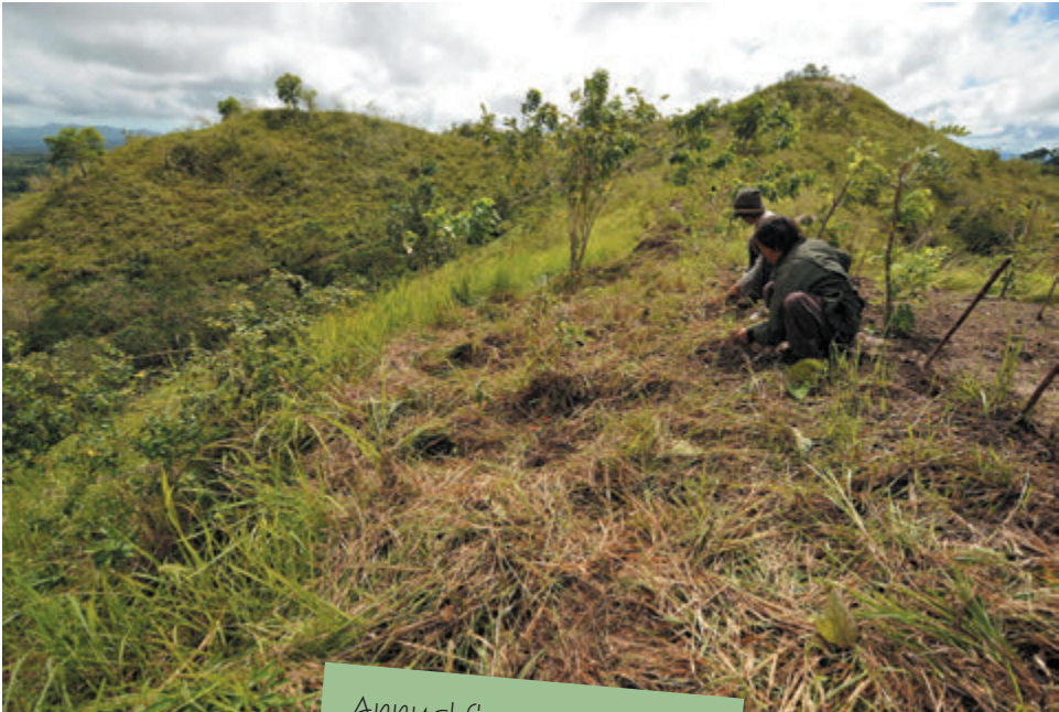
Figure 7. A target site for ANR