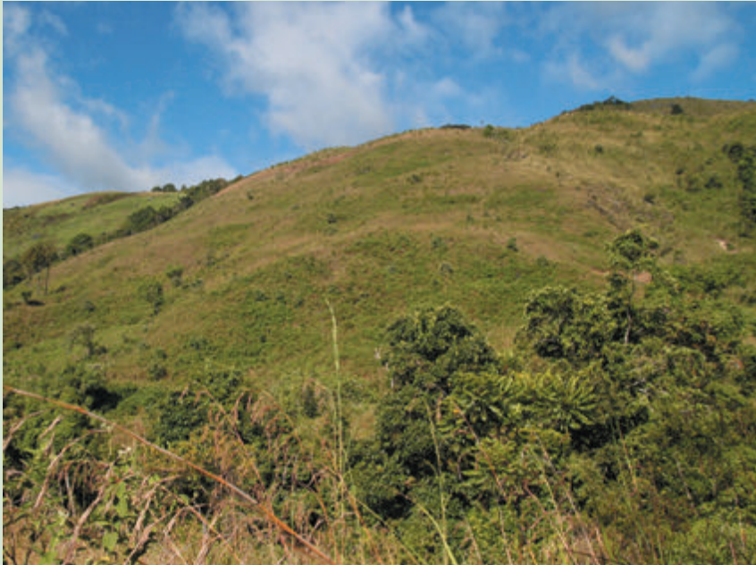
Figure 22. Agroforest developed through ANR after 3 years in Sumatra, Indonesia

With additional intercropping of economically-valuable trees, production progressively increased and as more farmers begin to apply ANR. By 2015, some 55 Paninggahan village families, with approximately 300 residents, had already benefited from ANR.