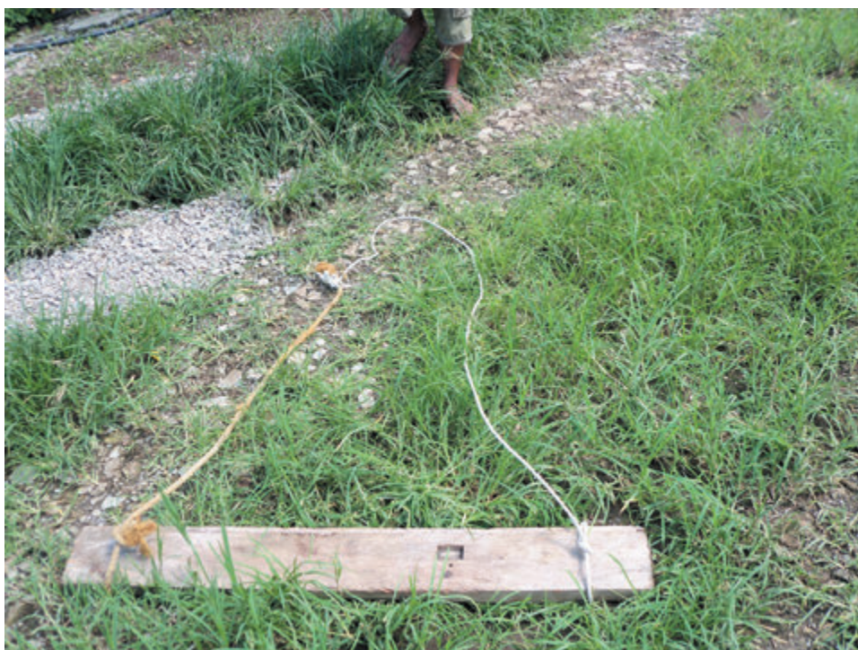
Figure 10. Lodging board

Lodging or pressing is done with a wooden board approximately 15 to 30 cm wide and 1 to 1.2 m long. Attach a sturdy rope to both ends of the board, making a loop that is long enough to pass over your shoulders. Ensure that the rope is long enough for the board to lay flat on the ground when you are standing upright. Adjust the rope length according to your height by knotting the rope.