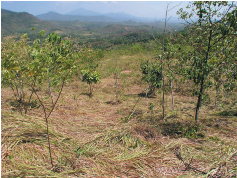
Figure 13. ANR site after grass pressing

pressboard on steep slopes is to help maintain footing and balance. In addition to enabling good control of the lodging board, the handles also serve as ‘walking sticks’ to prevent workers from slipping and falling. This precaution is especially important during rainy weather when slopes are slippery.