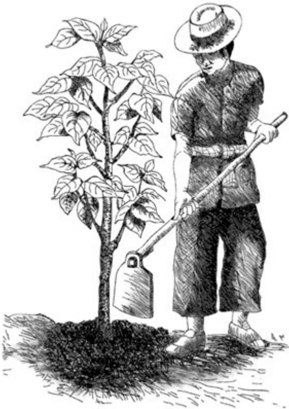
Figure 9. Ring weeding

Ring weeding should be implemented as often as necessary until the regenerants are tall enough to shade out competing undesired vegetation. In most cases, ring weeding should be done at least four times during the first year, and three times during the second and third years. After year three, the regenerants should be tall enough to shade out the competing vegetation without further assistance.