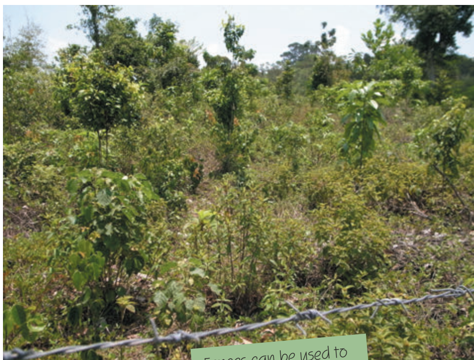
Figure 18. A barbed wire fence that excludes cattle results in quick recovery of vegetation in Sri Lanka

tree crowns have grown beyond the reach of livestock. Another solution is to cut the grass and fodder from ANR sites and carry them to the livestock. Not only does this feed the livestock without damaging the regenerants, it also encourages effective weeding of forest plots. In, Indonesia this technique is used for goat rearing in sheds. The goat dung is returned to the restoration site as fertilizer for the regenerating trees.