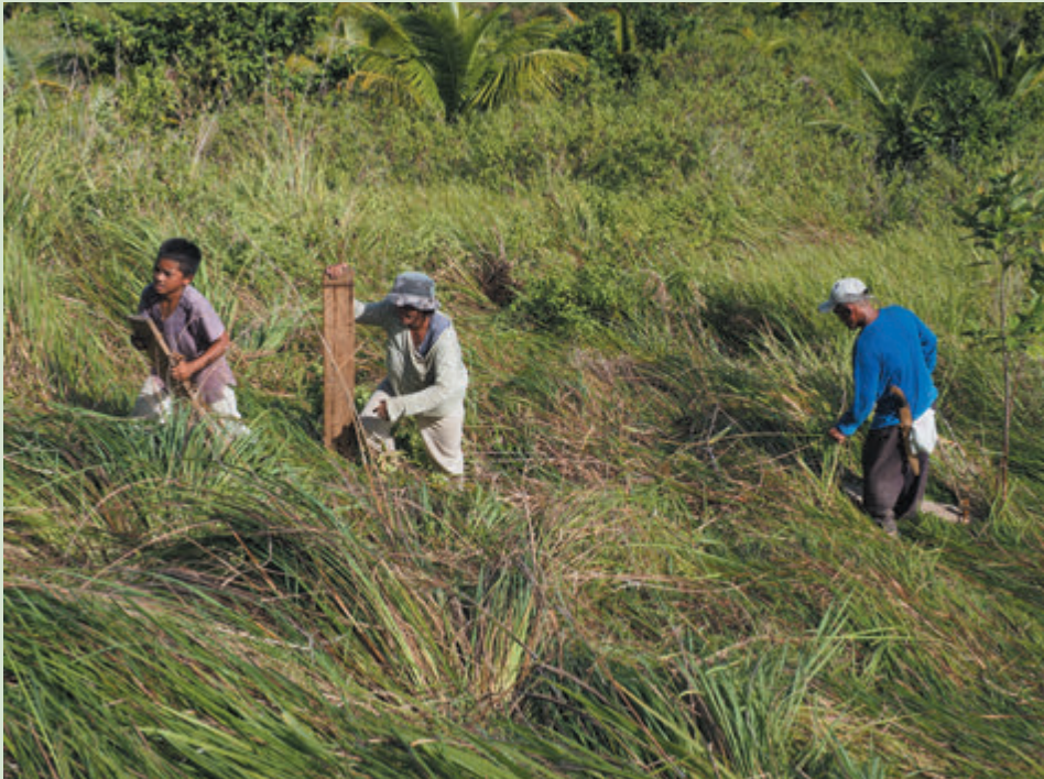
Figure 20. Supporting ANR is a family affair in Bohol

emergence of natural secondary forest species. Notable changes in plant diversity have also been observed within a span of 17 to 18 months. Apart from Danao, ANR has also been promoted throughout the Philippines, as the approach is a simple, inexpensive and effective technique for restoring forests at a large scale.