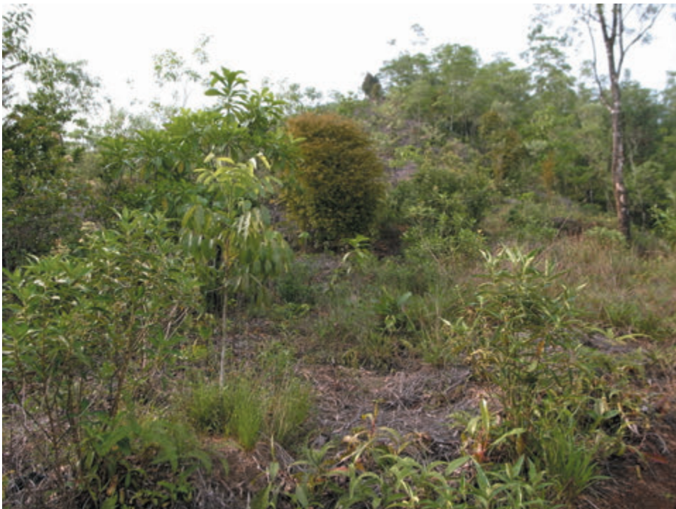
Figure 3. ANR results after two years

ANR accelerates the natural successional process by protecting against disturbances (from fire, stray domestic animals and humans) and by reducing competition from grasses, bushes and vines that hinders the growth of naturally regenerated trees. The same care that we apply to planted trees is applied to naturally regenerating trees. With adequate rain and good implementation, impressive ANR results are usually evident in less than three years (Figure 3).