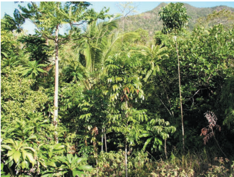
Figure 2. Mixed-species forest established after four to five years of ANR

There is increasing recognition of the benefits and advantages of ANR in light of the ambitious global, regional and national forest restoration targets, and there are considerable opportunities to expand the application of ANR through various restoration-related initiatives. It is hoped that this manual can serve as a field reference in guiding the application of ANR for forest restoration.