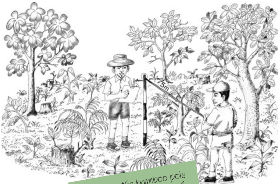
Figure 6. How to sample natural regeneration