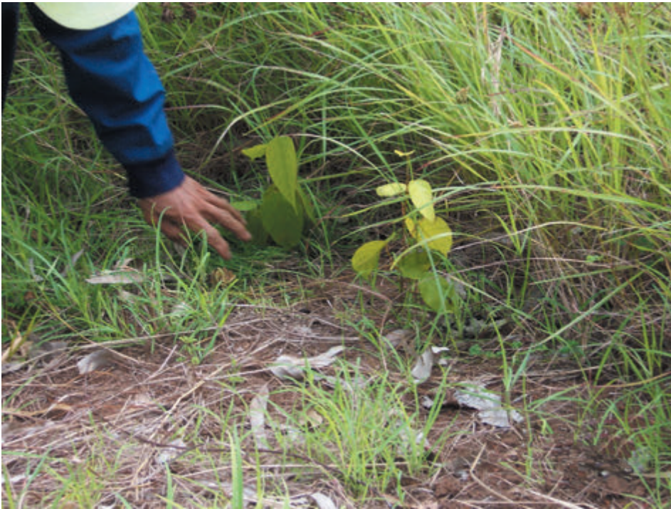
Figure 4. Naturally growing seedling hidden under the grass