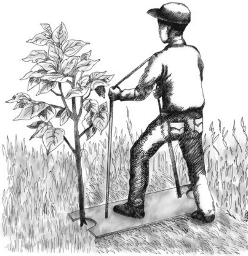
Figure 11. Grass pressing with a wooden board

Pressing is best carried out when the weeds are about 1 m tall or taller as shorter plants tend to spring back up shortly after pressing. The best time to press grass is a few weeks after the start of the rainy season and before the end of the rainy season when the grass stems are softer. A simple way to test whether an area is ready for lodging, particularly for Imperata , is to flatten a small section and wait overnight. If the grass starts to spring back up by the morning, then wait a few more weeks before trying again. Always press the weeds in the same direction. On slopes, press grasses downhill.