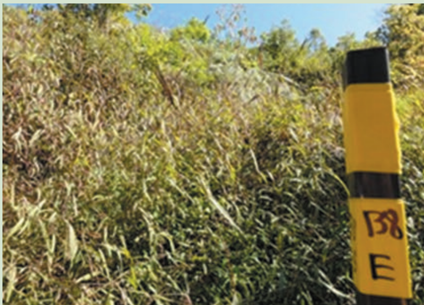
Figure 23. Top of a pole showing the ID number

Take photos of the vegetation at all boundary and sample unit center poles. At boundary poles, take photos looking towards the center of the study site. At sample-unit poles, take four photos, looking out from the pole roughly north, west, south and east (in that order). Take photos at other locations, which give the best possible view of the whole study site as needed but place a numbered metal pole at every photo monitoring point, for future reference. Set the camera to the widest possible zoom setting and the highest resolution. Frame each picture to include the top of the pole (showing the pole ID number) in the lower right-hand corner. Use a compass to record the direction of the photo. Keeping the top of the pole in the lower right-hand corner of the picture, gradually tilt the camera down to minimize the amount of sky in the shot, so the horizon should be near the top edge of the picture. Repeat photo-monitoring in the mid-dry and wet seasons and at annual intervals. Use the same camera with the same zoom and resolution settings for all photos. Transfer photos to a computer as soon as possible and rename the files as follows: pole reference number_date (yyymmdd) e.g. B08E_120315 (boundary pole 8, facing east, taken on 15 th March 2012).