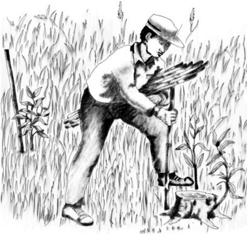
Figure 8. Marking of wildlings