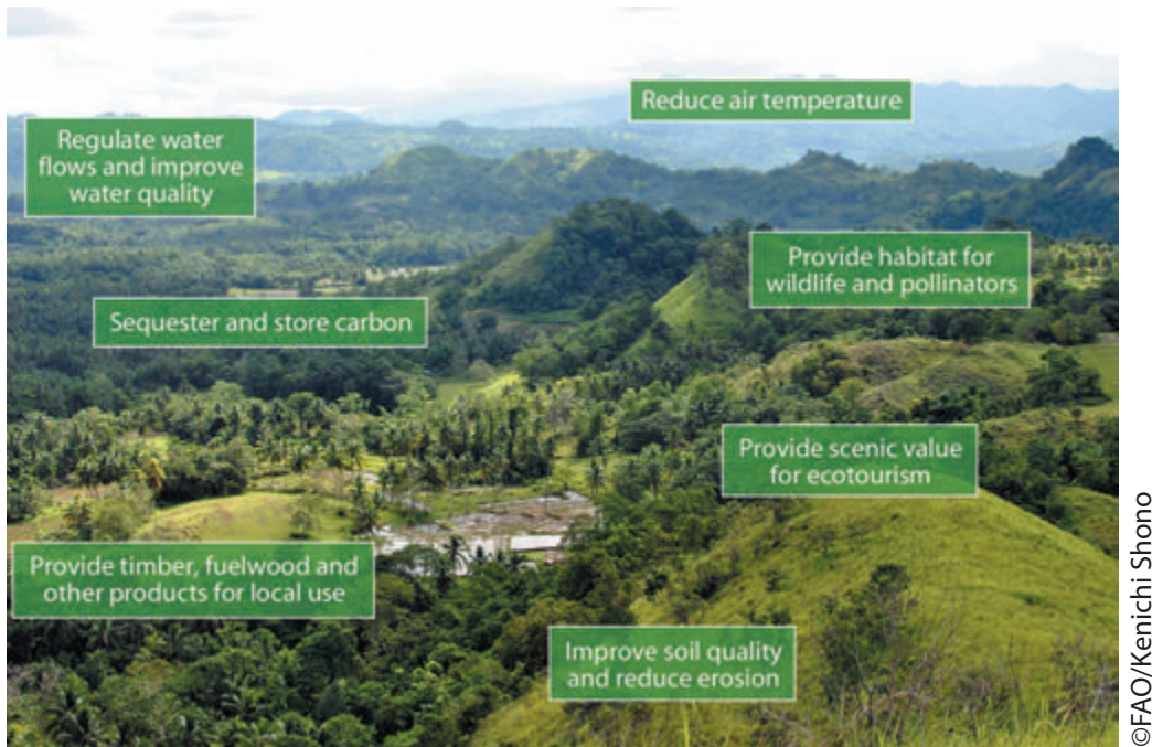
Figure 1. Natural regeneration can reduce the cost of restoration activities and deliver a wide range of forest products and ecosystem services that provide local to global benefits

lack of incentives for local communities; and uncertainty about the restoration processes and outcomes.